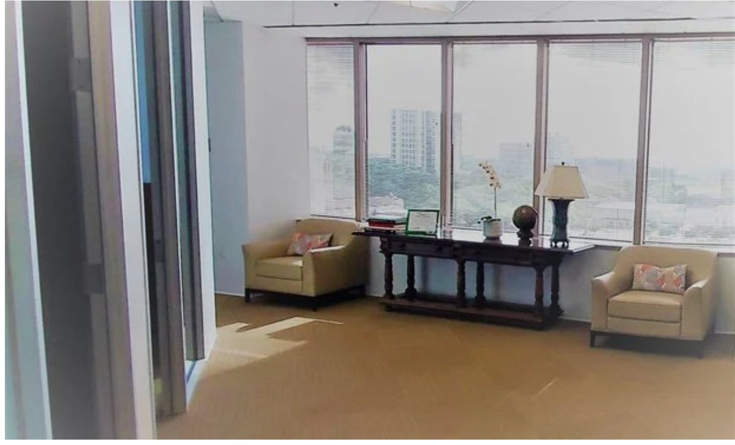
Kane Russell Coleman & Logan's new offices at Sage Plaza at 5151 San Felipe is located in the heart of Houston's Uptown district.