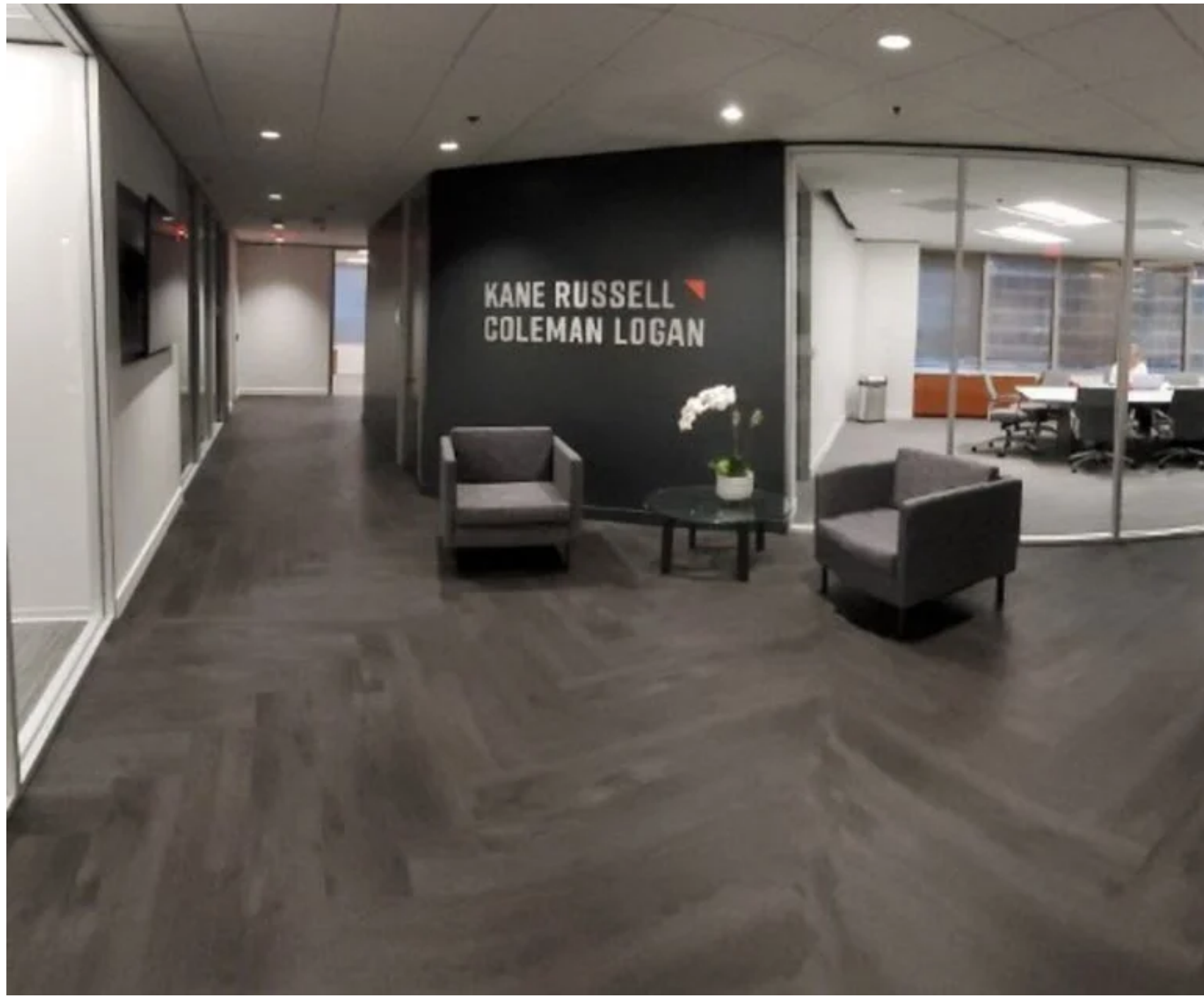
Kane Russell Coleman Logan's new offices at Sage Plaza at 5151 San Felipe is located in the heart of Houston's Uptown district.