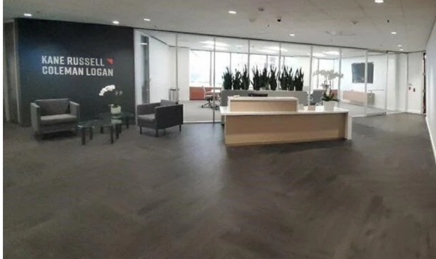
Kane Russell Coleman & Logan's new offices at Sage Plaza at 5151 San Felipe is located in the heart of Houston's Uptown district.