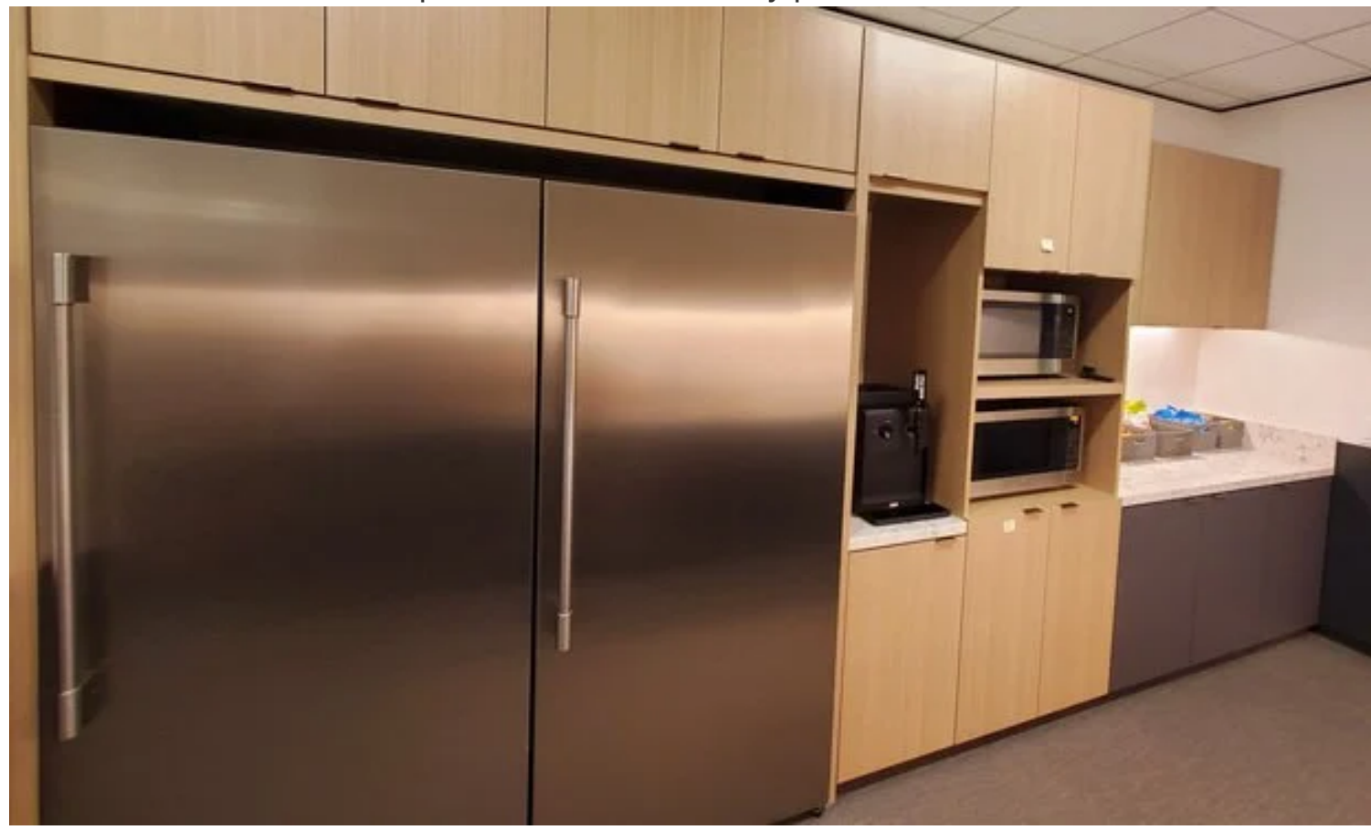
Kane Russell Coleman & Logan's new offices at Sage Plaza at 5151 San Felipe is located in the heart of Houston's Uptown district.